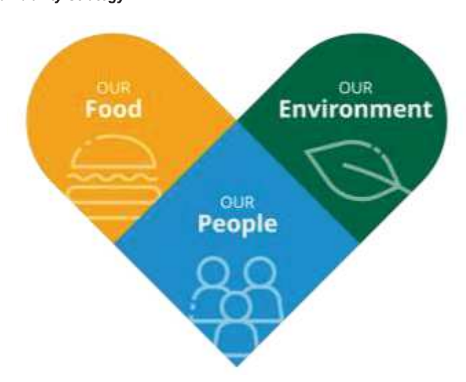
Infographic. AmRest Global Sustainability Strategy

The strategy is based on global sustainability standards, benchmarks and trends and reflects the existing and forthcoming legislation applying to ESG (Environmental, Social and Governance) areas.