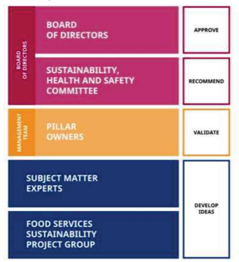
Infographic. Sustainability-related matters governance

Sustainability-related matters, as well as non-financial reporting, are coordinated globally by the External Communications and Corporate Affairs department, whose head reports directly to the Executive Chairman.