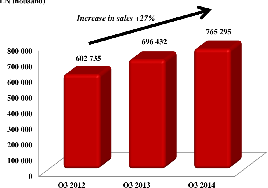
Chart 1 Sales dynamic in AmRest Group for the third quarter 2014 compared to previous years (in PLN thousand)

In New Markets sales revenues grew to PLN 48 940 thousand in Q3 2014 and PLN 136 876 thousand YTD. These represented respectively 37.5% and 41% growth compared to LY. Restaurants from Blue Horizon group accounted for the major share of revenues and highest dynamics of sales, which was a result of double-digit SSS growth. During last twelve months 10 new stores were added to portfolio in New Markets and total number of restaurants amounted to 38 at the end of Q3 2014.